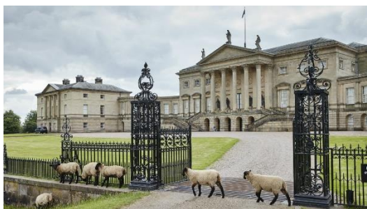
Kedleston Hall, Derbyshire

AGM followed by Lecture: Colonial Photographic Collections at the National Trust