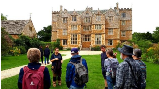
Walking group at Chastleton House

In September, our final day of walks for 2022 took us to Adlestrop and Chastleton House . We are planning six walks again next year but starting earlier ( in March ) and finishing later ( in October ). We would then omit July and August, when hot weather has led to cancellations.