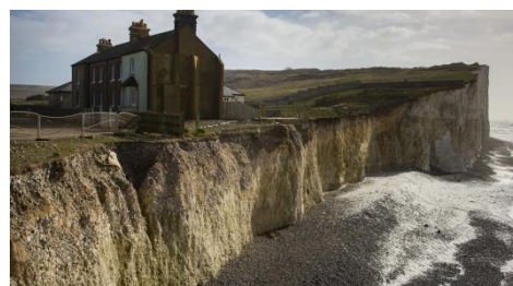
Birling Gap, 2017