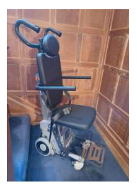
One of the new stair climbers

Firstly, we have been exploring how to improve accessibility at Nuffield Place . This ranges from acquiring seven new accessible picnic benches and tables, all with designated spaces for wheelchair users, around our horsebox concession on the tennis court, through to getting a stair climber that enables staff to help wheelchair users or those unable to manage stairs to the first floor of the property. We have also recorded a virtual tour of some of the first-floor showrooms and this will be ready for when the property re-opens in March 2025 so that visitors can choose to use this rather than going upstairs. Our future work now includes producing braille and large print guides for the rooms along with foreign language guides. I am also pleased to say that our sister properties Greys Court and Basildon Park also have stair climbers, with virtual tours and accessible guides, so please do spread the word! The stair climbers need to be pre-booked through our website, but the virtual tours and accessible guides will be available from late February on-property.