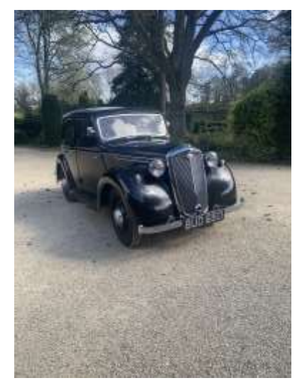
Above: Lady Nuffield's Wolseley 8 "BUD"

Our other projects have all been collection focused, with clock restoration, curtain restoration, condition surveys of various items all around the property and, most relevant to the OCNT, starting the process of caring for Lady Nuffield's Wolseley 8 "BUD". The OCNT donation to Nuffield Place in 2024 of £2,000 towards maintaining BUD and supporting the repairs or conservation that is required is wonderful and so generous. We are currently waiting on the report following a full condition survey of BUD (undertaken in November 2024) to then decide the next steps of conservation and focus of work, but BUD has already been treated to a brand-new battery (installed in January 2025) to keep the engine running.