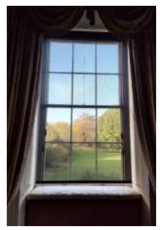
Blinds in the Dining Room, Basildon

the Shell Room and Lady Iliffe's bedroom. "This is a very generous donation and is helping us with our continued efforts to protect our collections, for now and for ever. I am delighted to share images from our most recent blinds which have been installed in the House ... . These draw string blinds allow us to control the levels of UV in each room and thus conserving our collection." ... "Our Collections Team will be delighted more rooms, and the collection pieces they hold, will be protected. Once the blinds are installed, members of the Oxford Centre are more than welcome to arrange a visit with us to see them in person." (Fable Bella, Senior Visitor Experience Officer, Thames Valley Portfolio)